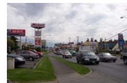
Transportation impact fees

Properties are distributed throughout the county. This cycle represents the largest purchase ever made. The next cycle for application will